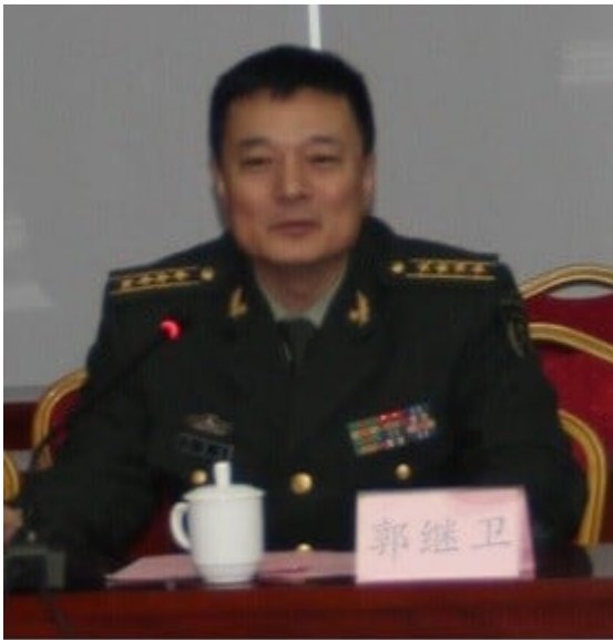
Colonel Ji-Wei Guo

In a 2006 follow-up article, Colonel Guo expands on his thesis, advocating the weaponization of military medicine, in order to make it: